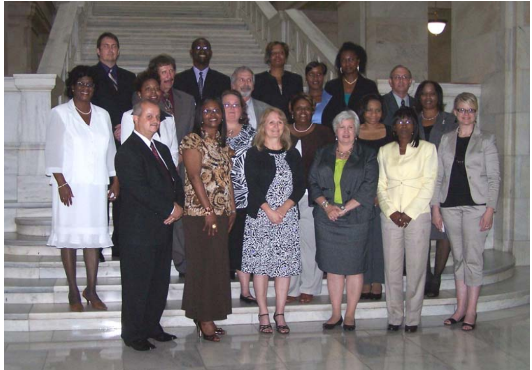
2010 AGM Graduates

The Society offers its congratulations to all the graduates on this success.