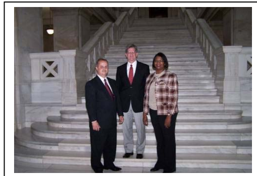
2010 CPM Graduates